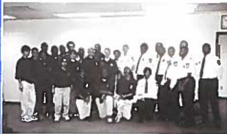
Police Explorers completed the training program

The Baltimore Police Explorers spent a portion of their spring break at the Education and Training Division learning various aspects of police work. The Explorers were trained in traffic control, first aid, fire safety, radio communications and participated in a military drill. With this training, the Explorers can continue working effectively with police officers. For more information about the Baltimore Police Explorers Program, call Officer Karla Lerner at (410) 396-2372.