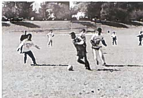
Players from the Baltimore Police Department and Chinese team face off on a terrific match.

On October 24 th , members of the Department participated in the First Annual Baltimore International Community Cup . The Baltimore Police Department, the Korean Society of Maryland and the Baltimore Community Relations Commission sponsored the soccer tournament held at Herring Run Park.