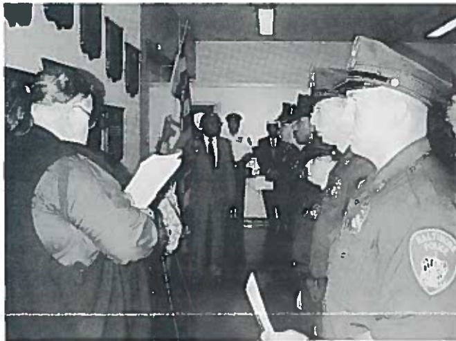
Western District officers hold memorial service.

On May 19th, a District-Wide Memorial Service was held at each of the nine Baltimore Police Districts to honor and remember the police officers who gave their lives while acting in the performance of their duties. A total of 27 Memorial services, were held at the beginning of each shift, and lasted approximately 15 minutes.