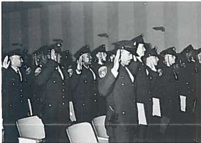
The Class of 99-1 is officially sworn in.