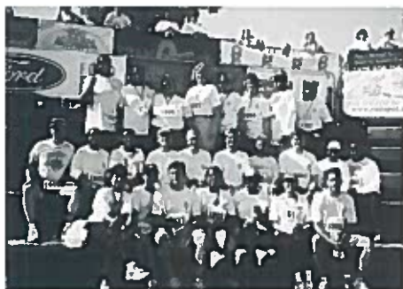
The 1999 Baltimore Police Department Run/Walk Team

On October 3, 1999, 44 members of the Baltimore Police Department competed in the Maryland Chapter of the Susan G. Komen Breast Cancer Foundation's Race for the Cure. As members of the Department walked and ran, more than $1,100.00 was raised for breast cancer research.