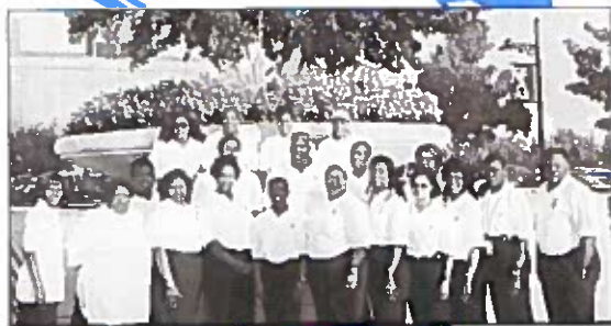
Pictured above: The Baltimore Police Department's choir The Thomas C. Frazier Voices of Hope sang the National Anthem for Officer Appreciation Night