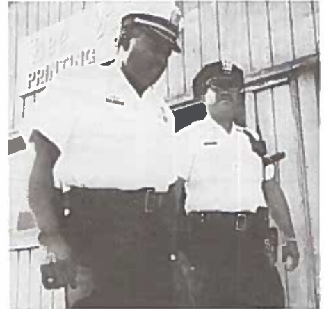
Police Commissioner Edward V. Woods and Sergeant Roderick Pullen walk foot post along North Avenue.

To combat an increase in violent crime, Police Commissioner Edward V. Woods announced the deployment of 52 overtime foot patrol officers on July 23rd. The overtime foot patrol officers will be deployed in the most violent sections of the city and areas notorious for illegal drug activity. There are overtime foot posts in all 9 police districts. The posts were selected based on crime statistics and input from District Commanders and residents. The posts may change based on crime patterns. Officers volunteer to work the overtime foot posts which will remain in place until the end of 1993.