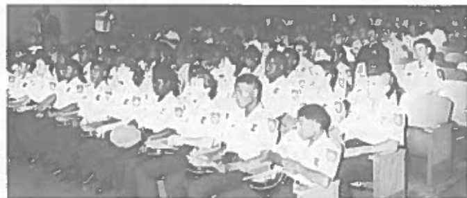
One step closer to the Academy ... 39 explorer scouts graduated from the Police Department's Explorer Program, September 25, 1993.